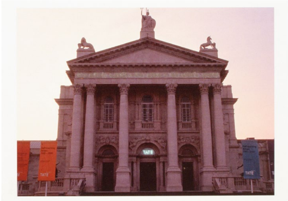
Work No. 232, 2011