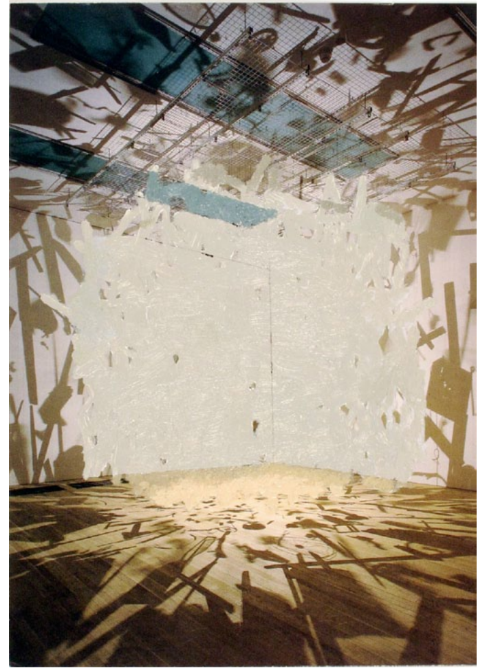
Cold Dark Matter: an Exploded View, 2011