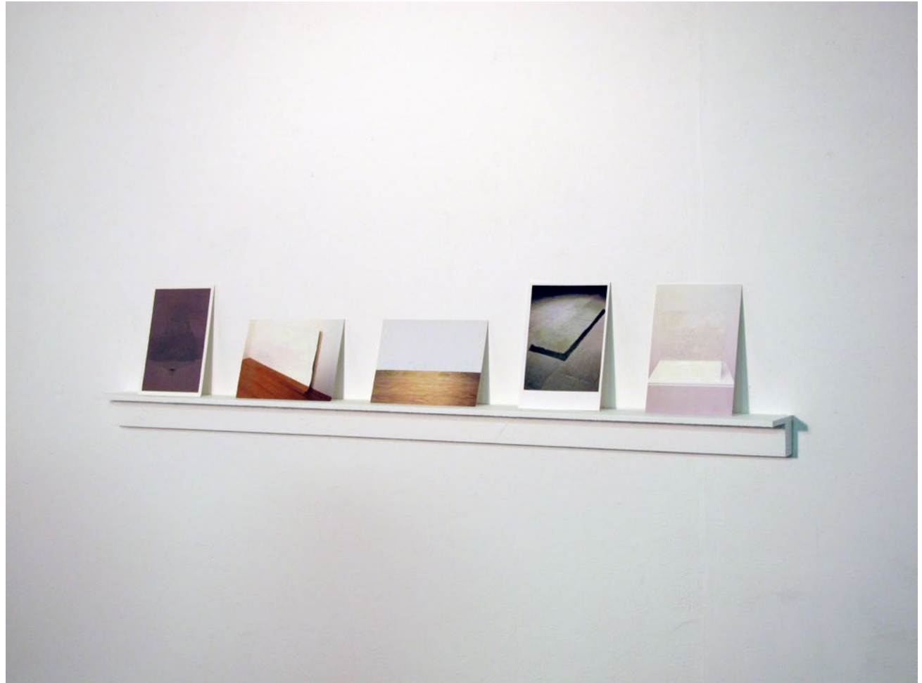
Veil of Invisibility, 2011 (Installation view at the studio)

The installation of the piece in the exhibition space also becomes a further investigation into the current curatorial practices, both within the museums and with in contemporary art practice. This is achieved by involving curators to actively curate the piece every time is shown, by selecting works from my collection and choosing their display via a set of prepared guidelines. The curator, instead of curating different individual pieces as it would normally do in an exhibition, would be curating a single artwork, turning the moment of exhibition into a new work each time.