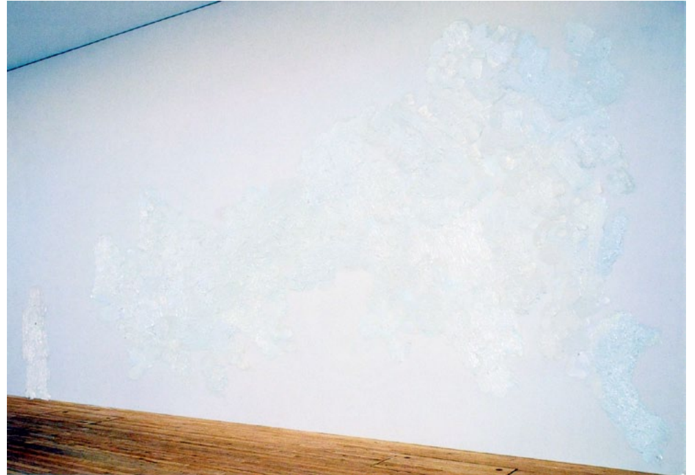
Britain from the North, 2011