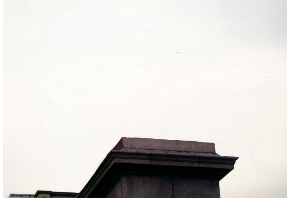
Model for a Hotel, 2011