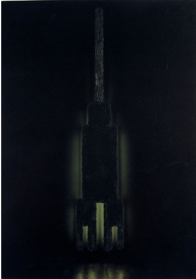
'Monument' for V. Tatlin, 2011