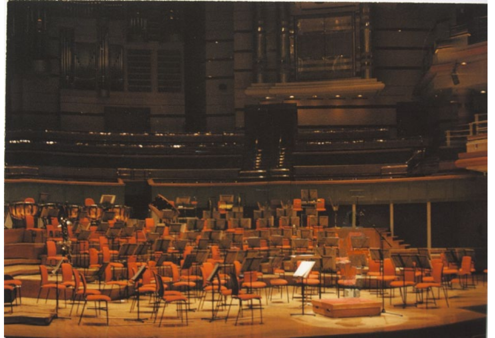
Nail Biting Performance, 2011