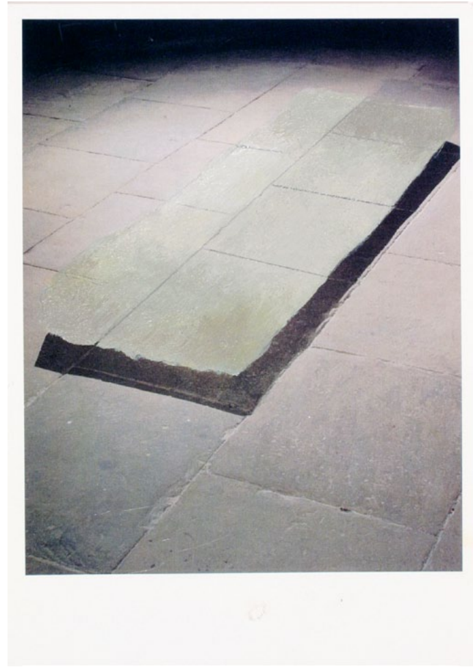
Equivalent VIII , 2011