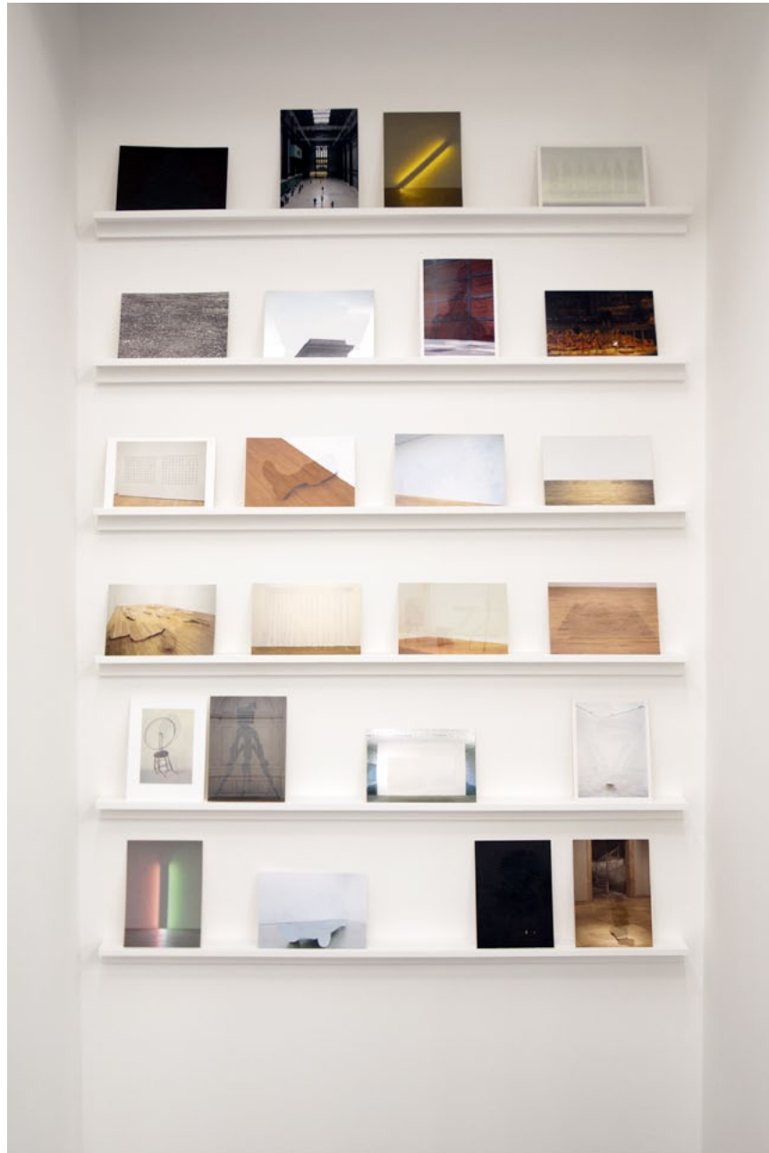
Veil of Invisibility , 2011 (Installation view at the studio)