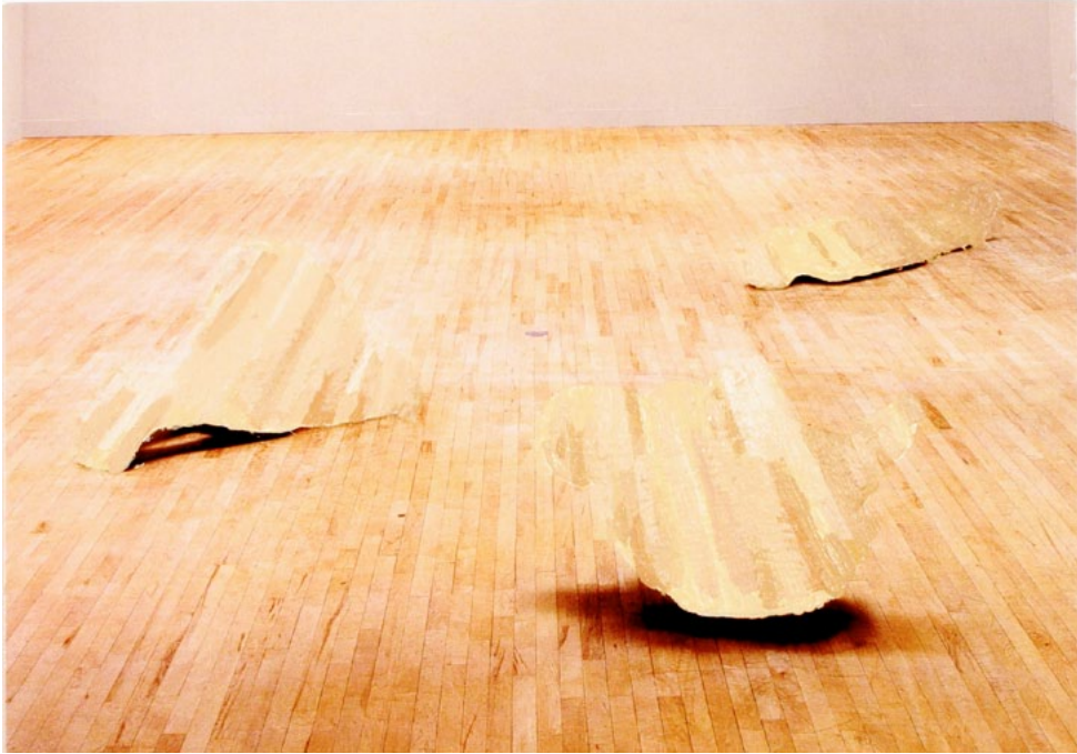
Three Ways: Mould, Hole and Passage, 2011