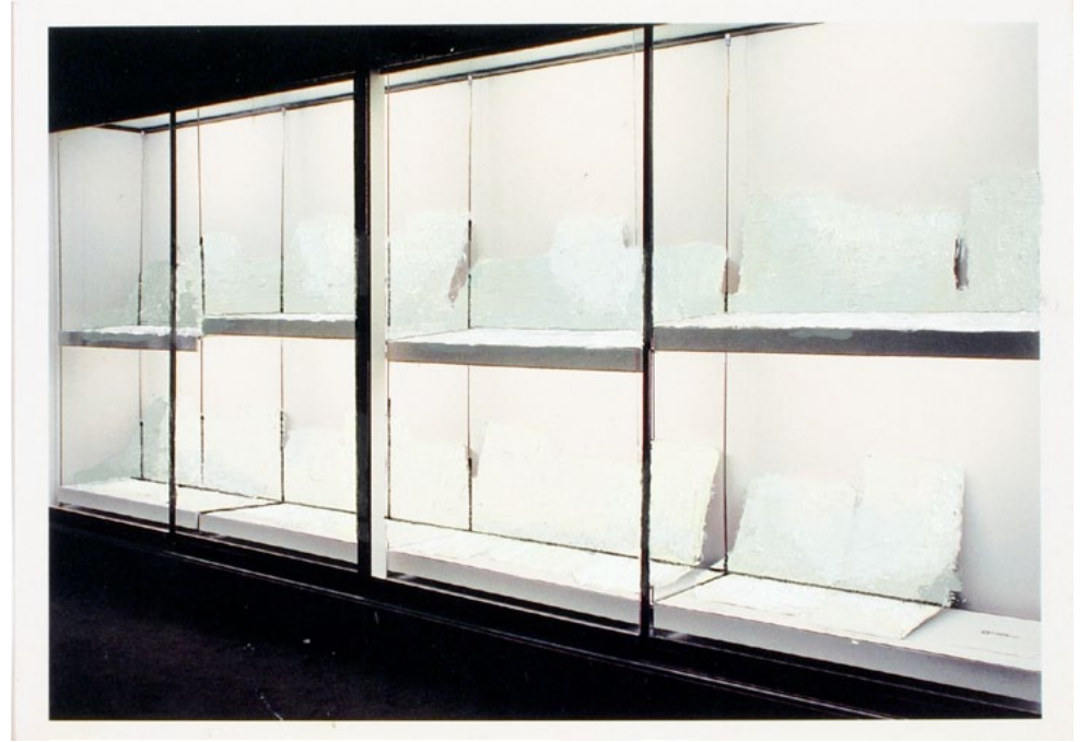
From the Freud Museum, 2011