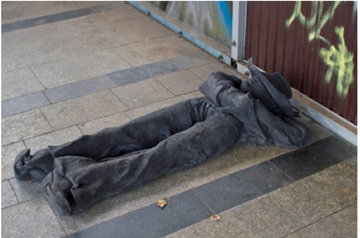
Sleeping Cowboy sculpture concrete, black pigment 183 x 40 x 30 cm 2011