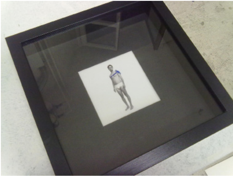
Boy With Ghetto Palm - video stills from animation (20" - infinite loop)