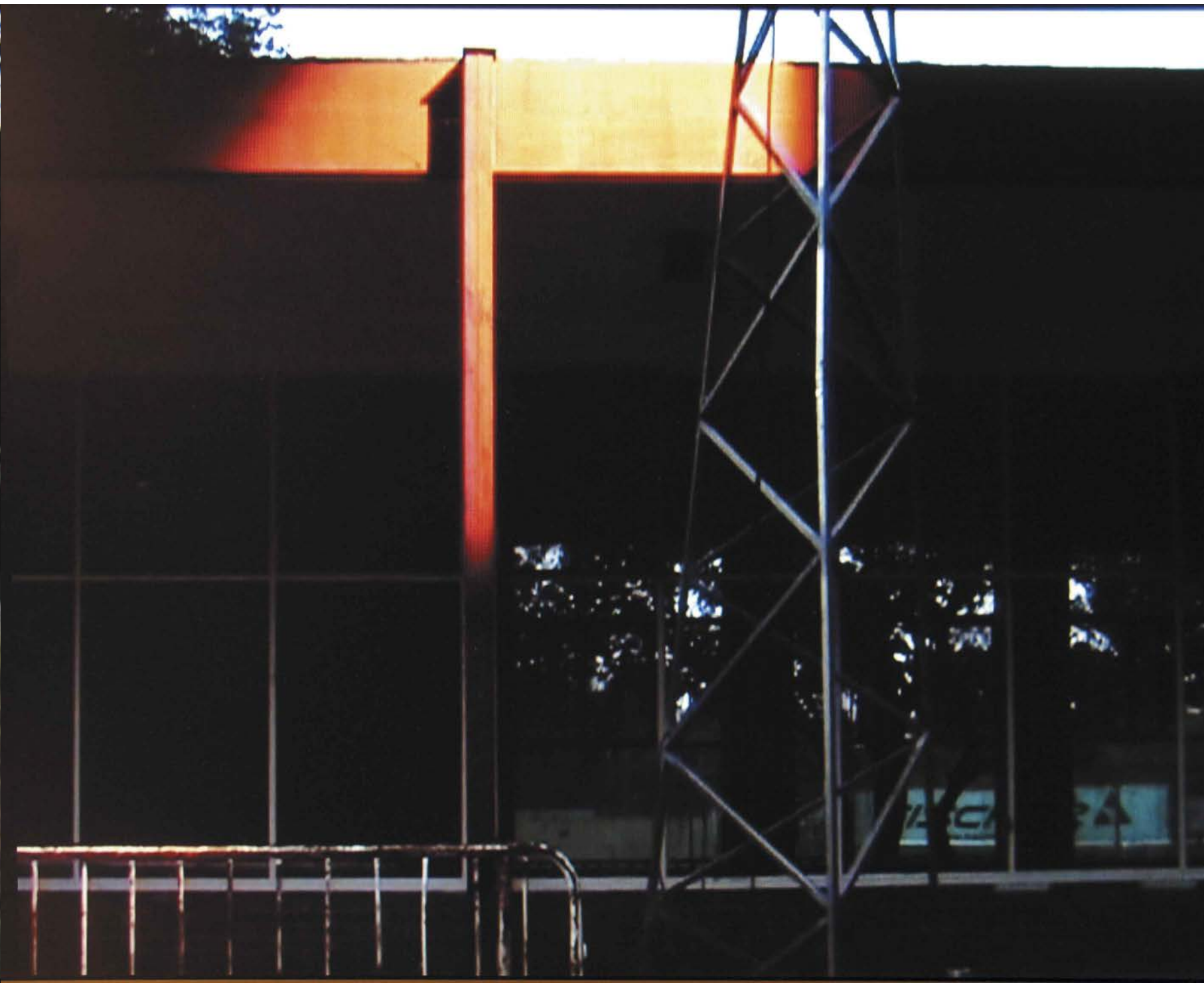
REALITY (SHOW) , 2008, stills