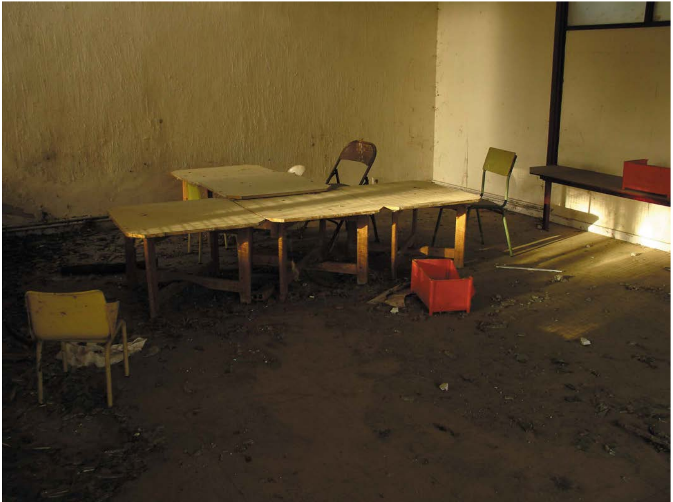
REALITY (SHOW) , 2008 Tower detail and photograph