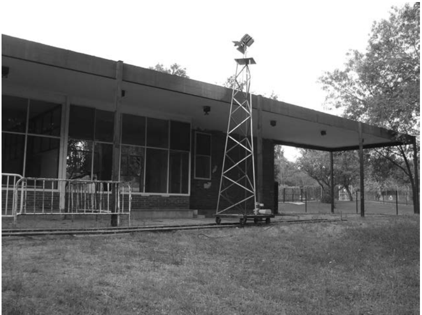
REALITY (SHOW), 2008, details