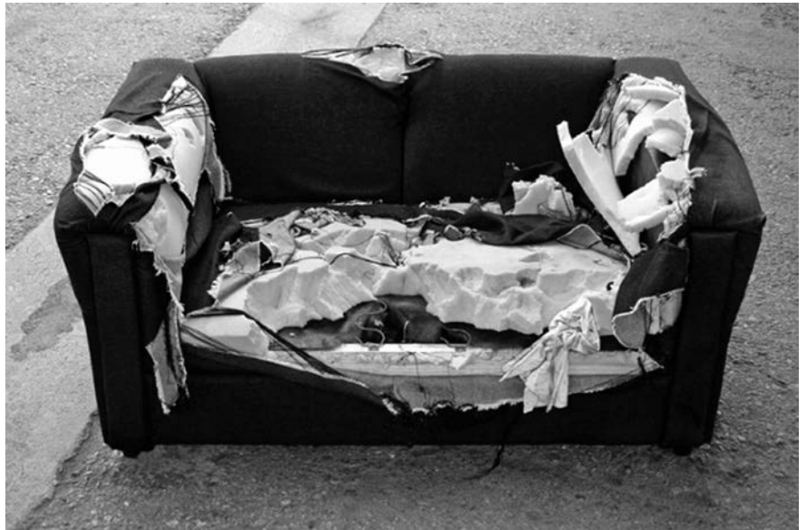
Anger Moments Jaime de la Jara 2011