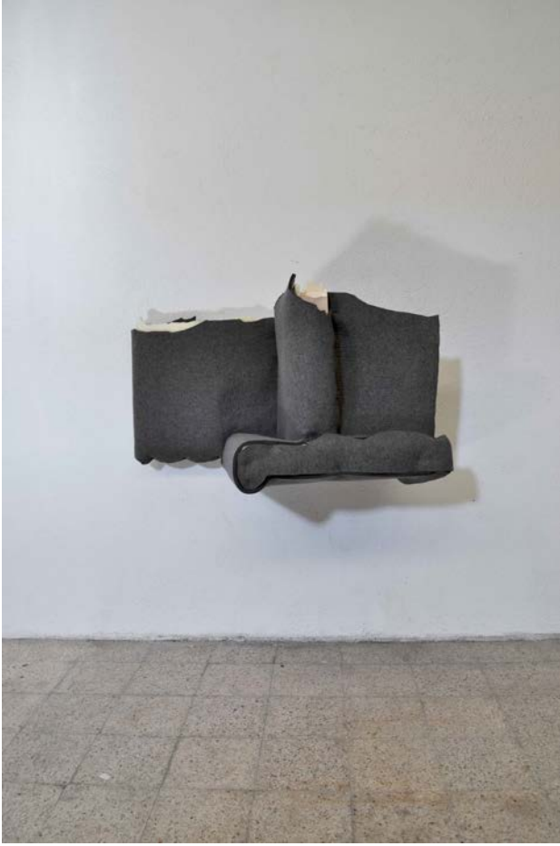
Last site 2011 Sculpture Industrial felt (lana), wood and foam 125 x 90 x 80 cm