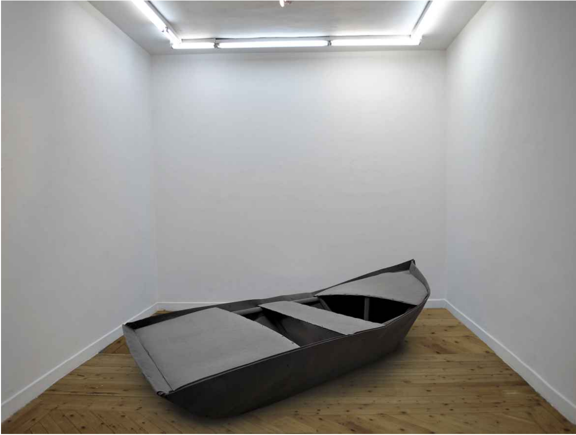
Barca española 2011 Sculpture Sintetic felt, wood and fabric 120 x 300 x 110 cm.