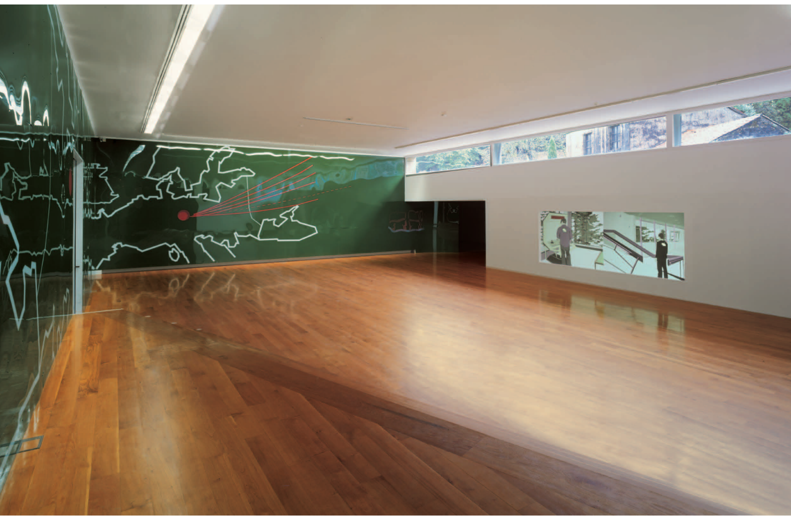
What we are expected to do, View of the exhibition at the CGAC, Santiago de Compostela, 2003

For the exhibition “Lo que se espera de nosotros” (What is Expected of Us) at the Galician Centre of Contemporary Art I used constructivism as a link between aesthetics and ideology. Through a mural with a map of Europe which covered the space and two back-projections, I elaborate an juvenile organization which was shown to the spectator as a image; its infrastructure, architecture, means of transportation, and so on. However, there was another back-projection, hidden from the main room, which showed another aspect of the organization, its flip side, and how the interweaving of personal relationships amongst its members could have a tragic impact on the organization’s carefully elaborated image.