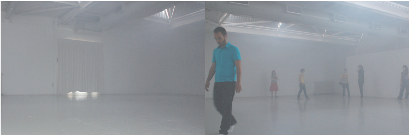
2009, empty room, white smoke / variable dimensions