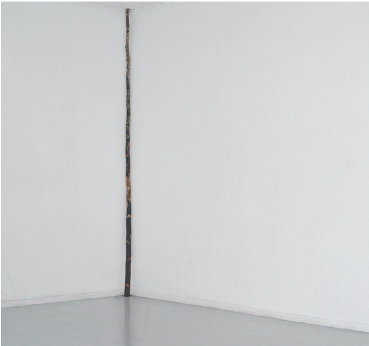
2009, stick / 389cm high