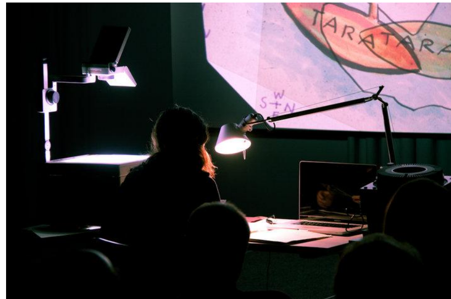
Ellie Ga: The Fortunetellers Part 1 + The Fortunetellers: Arctic Circles