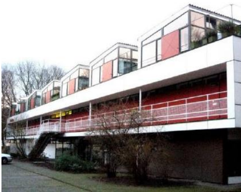
Eternithaus, Hansaviertel, venue of the performance series