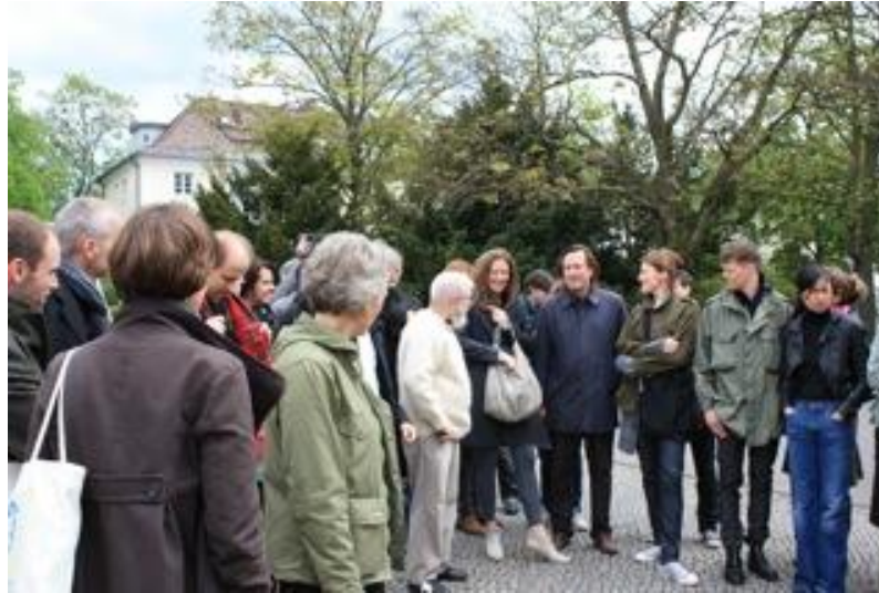
Dan Graham/Nicolas Guagnini, Tourguide – A Platonic Dialogue Through the City